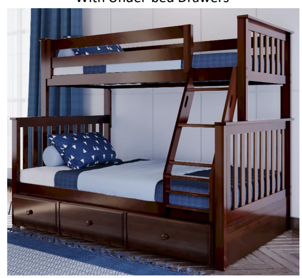
L:81.25" x W:59.5" x H:68.50"