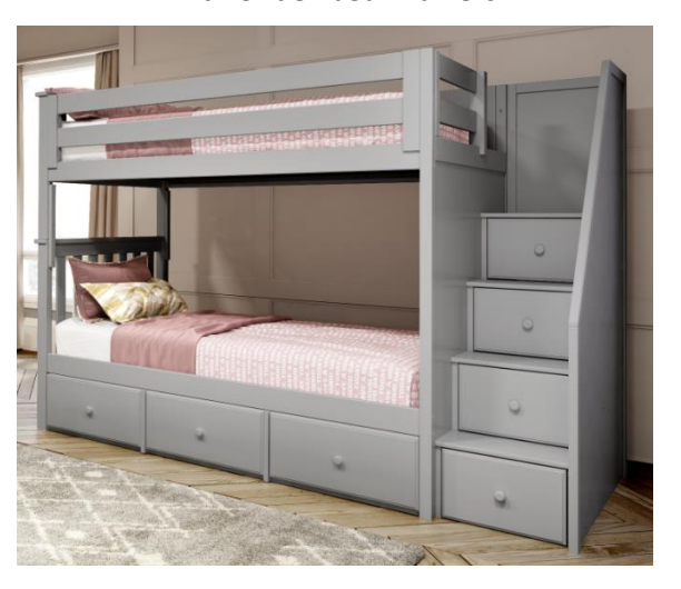
L:99" x W:42.75" x H:68.50"