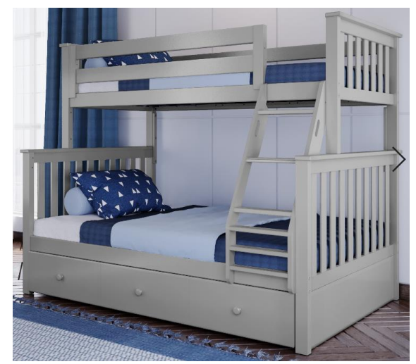
L:81.25" x W:59.5" x H:68.50"