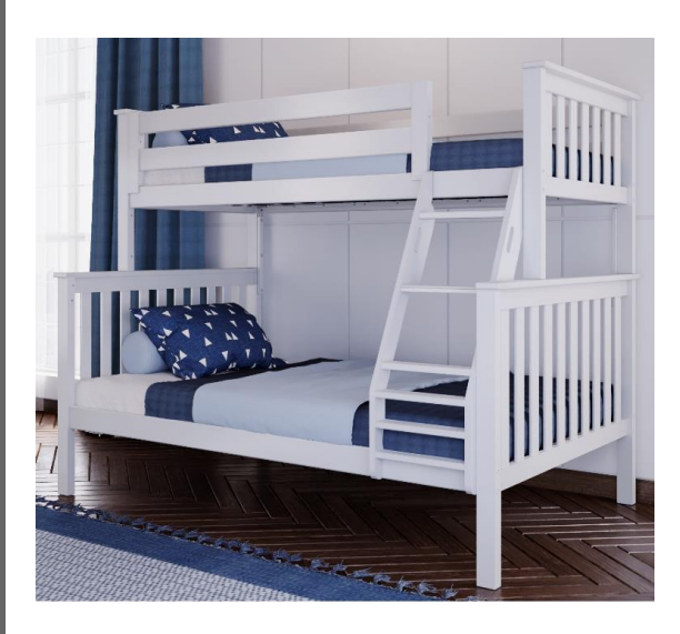
L:81.25" x W:59.5" x H:68.50"