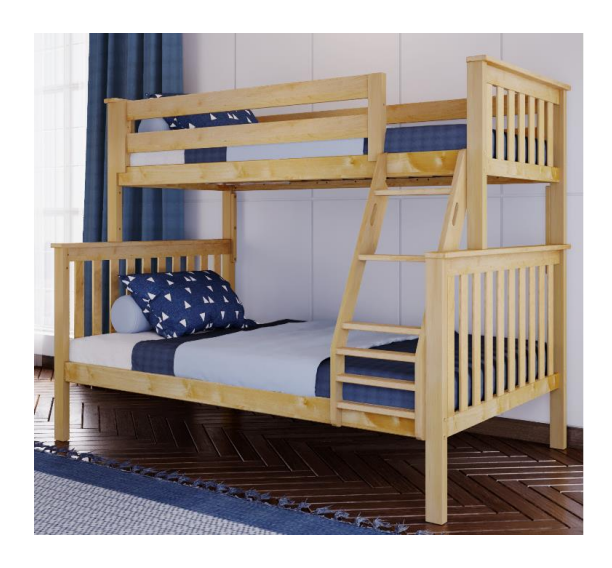
L:81.25" x W:59.5" x H:68.50"