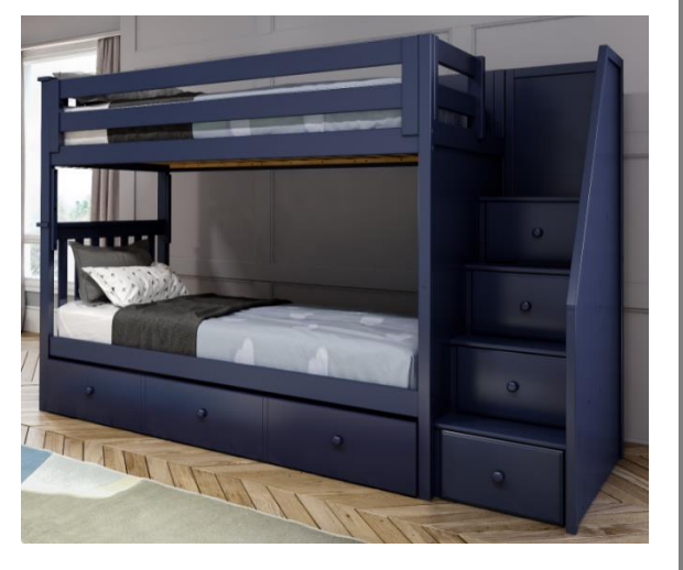
L:99" x W:42.75" x H:68.50"