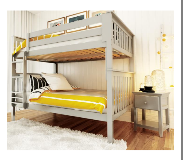
L:81.25" x W:60.5" x H:68.50"