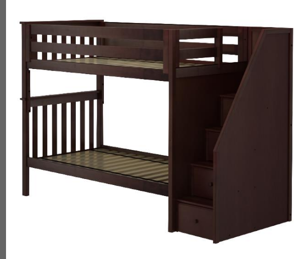
L:99" x W:42.75" x H:68.50" (L:251cm x D:109cm x H:174cm)