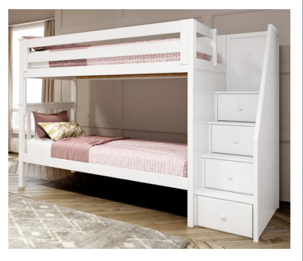
L:99" x W:42.75" x H:68.50"