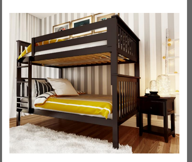
L:81.25" x W:60.5" x H:68.50"