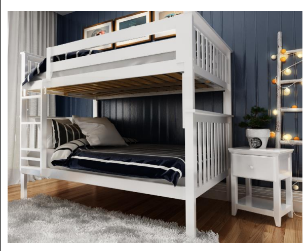
L:81.25" x W:60.5" x H:68.50"