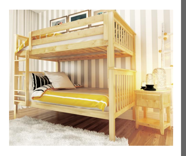
L:81.25" x W:60.5" x H:68.50"