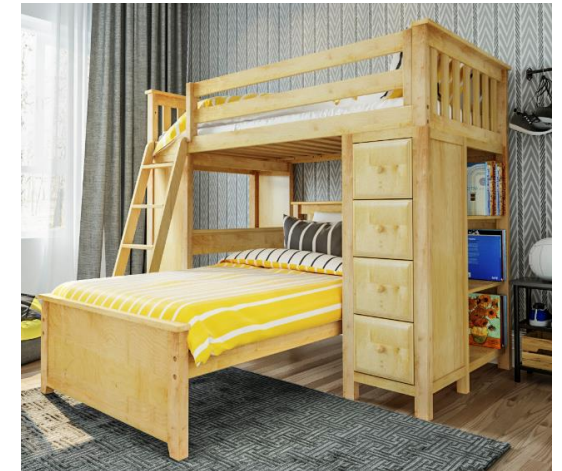
Option to add an extra Bed

Safety First: Tall (15") Guardrails & Angel ladder with grooved steps for extra safety